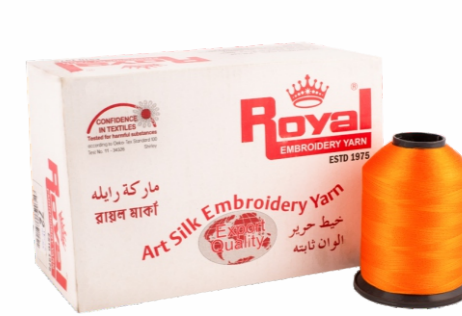
VRY 120/2 (Jumbo)