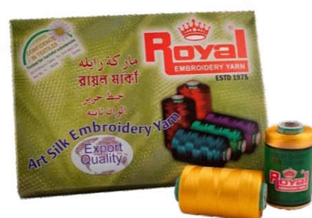
VRY 120/2 (Tube)