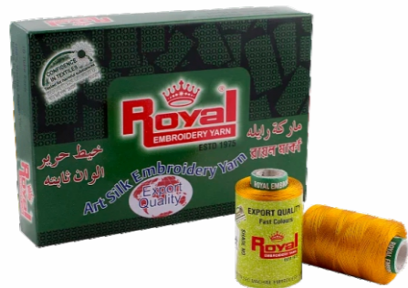
VRY 150/2 (Tube)