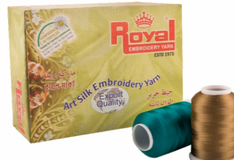
VRY 120/2 (Cone)