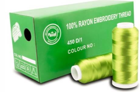
VRY 450/1 D