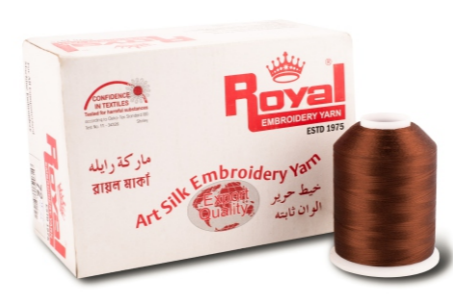
Tri. Polyester (Jumbo)